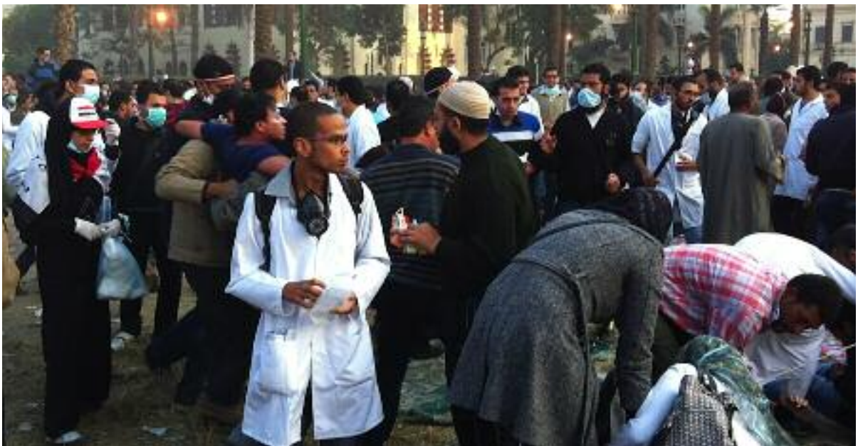
Egyptian volunteers treat those who were wounded from clashes with security forces in Tahrir Square, Cairo (November 2011).

One of the first things I covered in Israel was the story of Gilad Shalit, a young Israeli soldier who was held captive for more than five years by